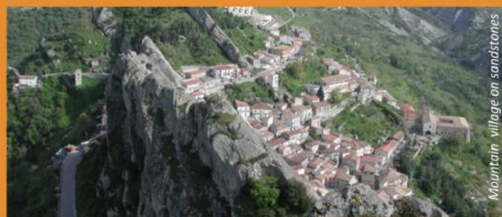
Mountain village on sandstones